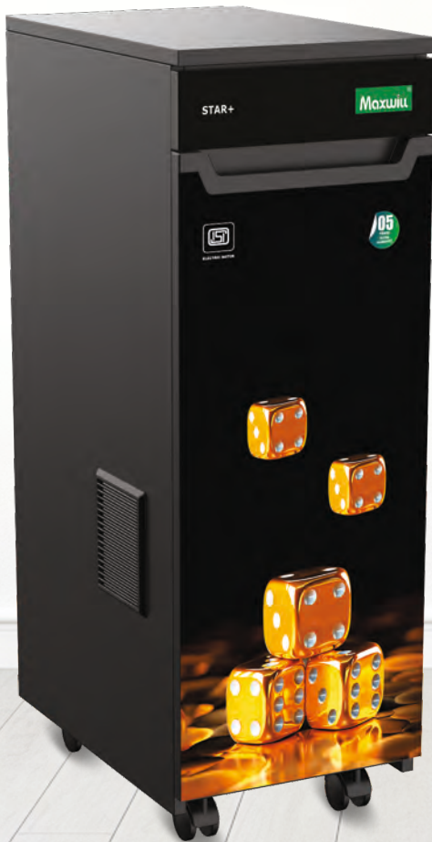
Colour : Golden Cubes