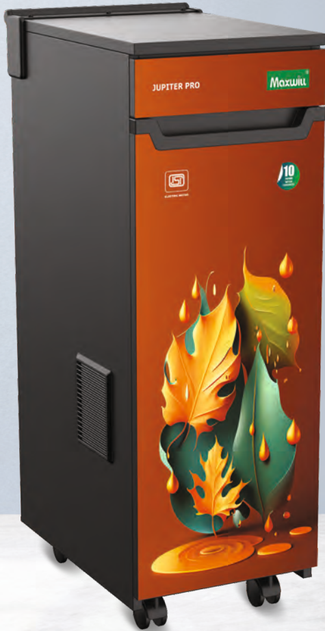
Colour : Leaf