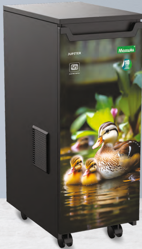
Colour : Duck