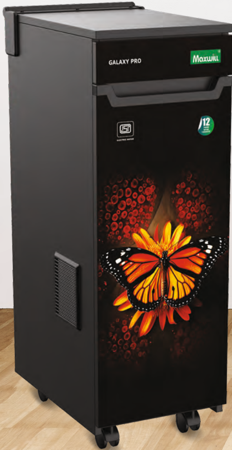
Colour : Yellow Butterfly