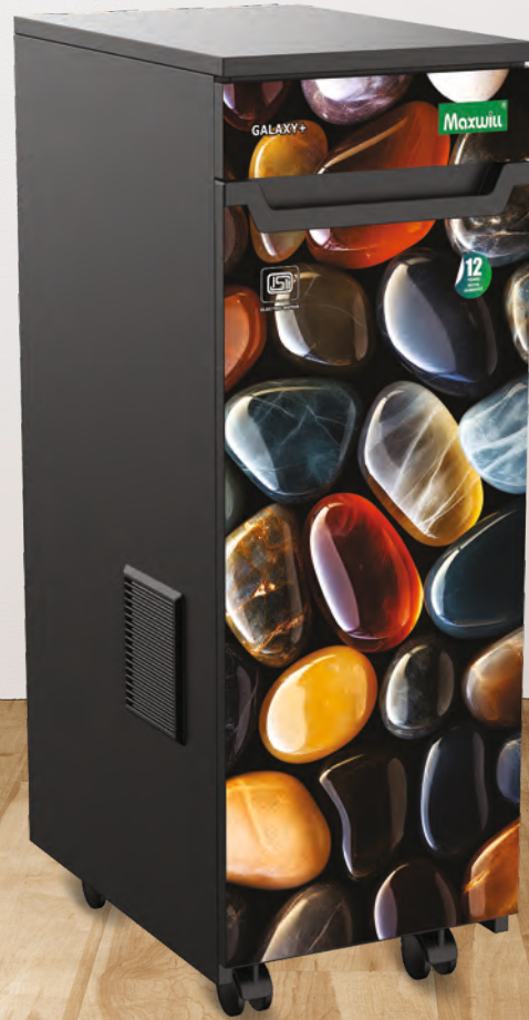
Colour : Pebbles