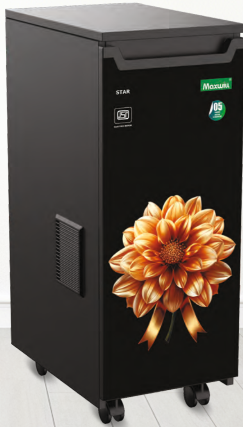
Colour : Pushpam