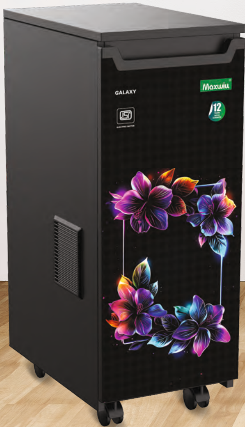
Colour : Flora