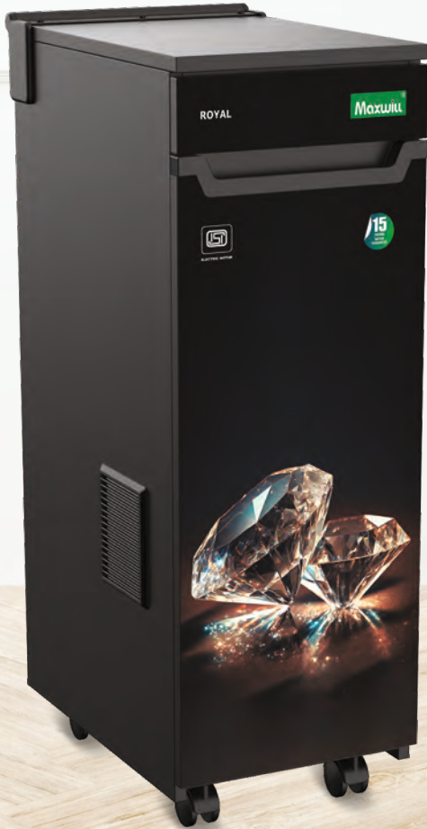
Colour : Kohinoor