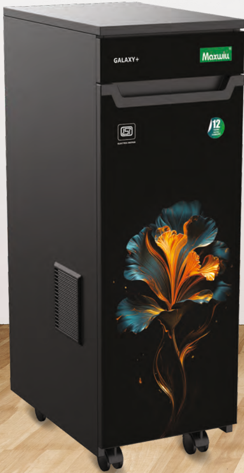
Colour : Harmony