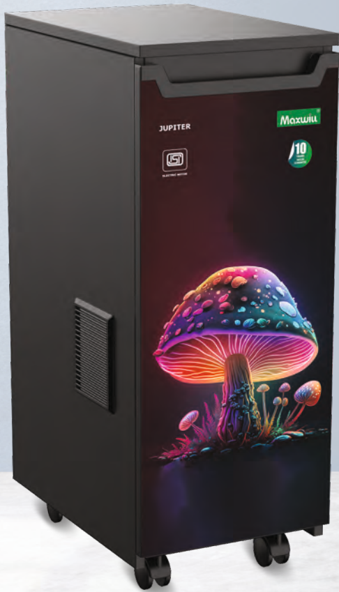
Colour : Mashroom