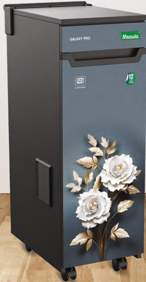
Colour : White Rose