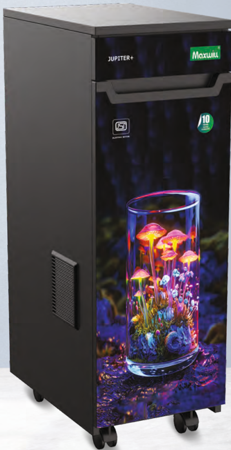
Colour : Miracle