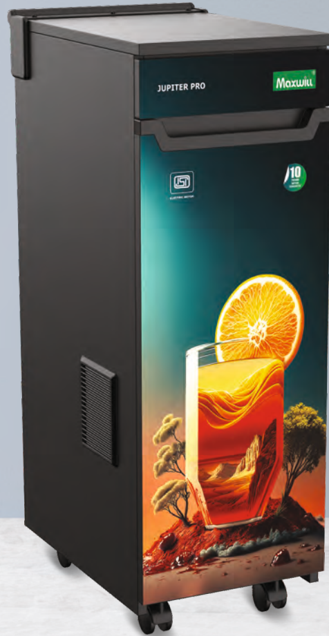
Colour : Dream Glass