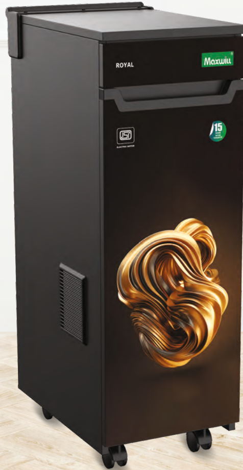
Colour : Jewel