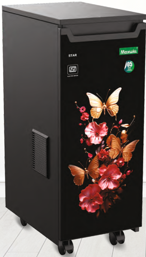
Colour : Titli