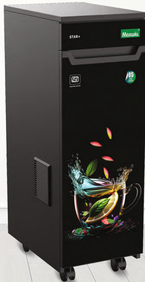
Colour : Lemon Tea