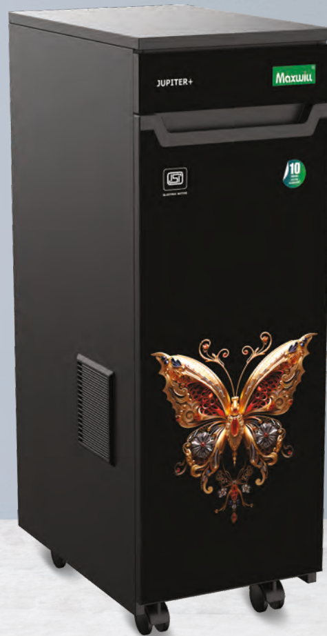
Colour : Golden Butterfly