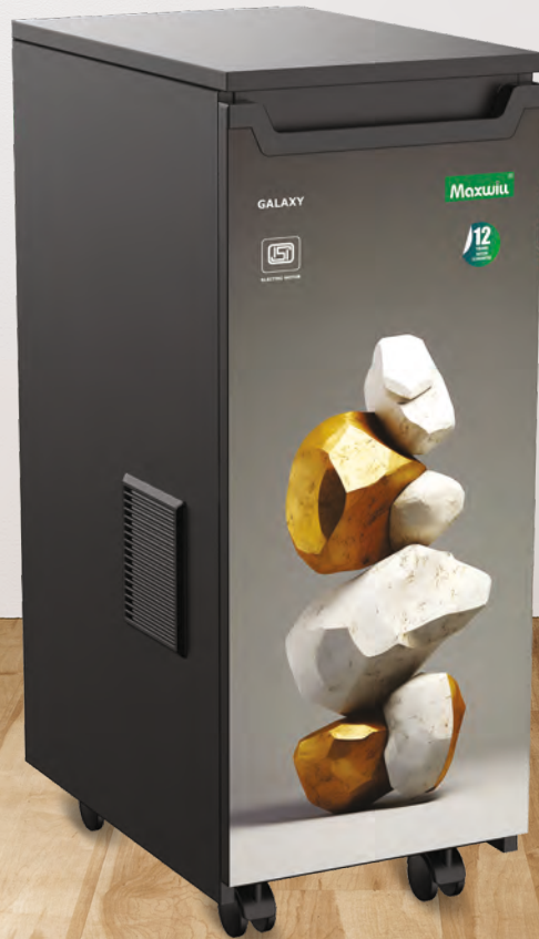
Colour : Marbel